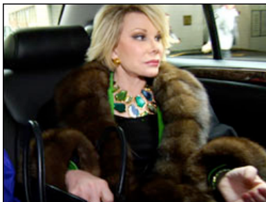
'Joan Rivers: A Piece of Work' • Gallery: 2010 Tribeca Film Fest.

Looking to make festival films more accessible to moviegoers everywhere, Tribeca will offer a dozen films via VOD, and eight features online via Tribeca Film Festival Virtual, including "Spork" and "Engine Slayer."